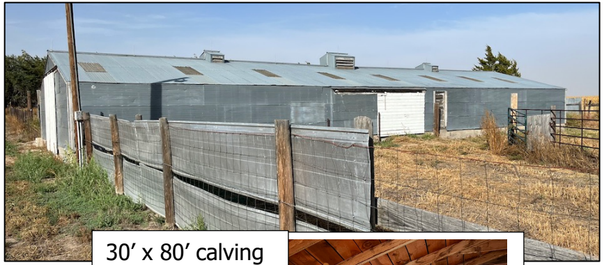
30' x 80' calving barn with catch alley, auto head catch & vet room.