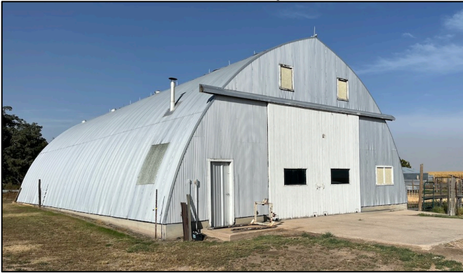
40' x 70' machine shed.