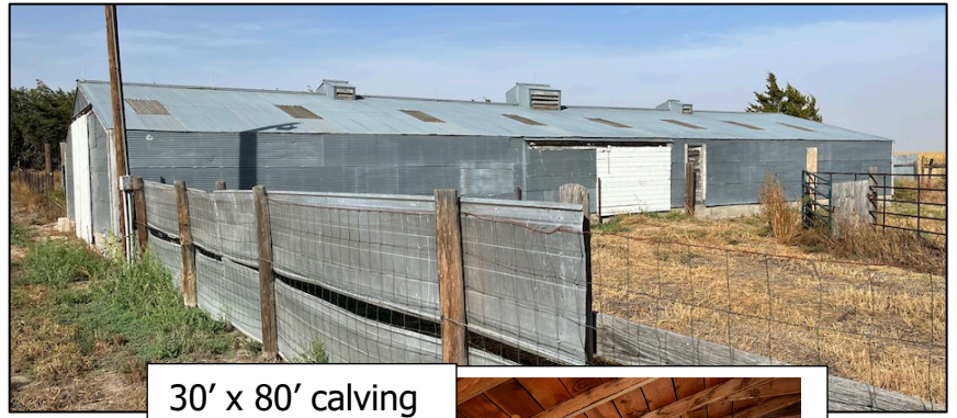
30' x 80' calving barn with catch alley, auto head catch & vet room.