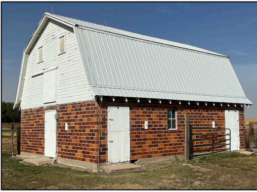
26' x 32' block barn with hay mow & stalls.